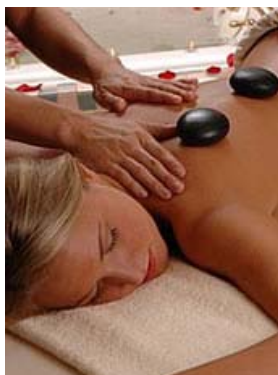
SPA BOTANICA IS LOCATED WITHIN THE EMBASSY SUITES HOTEL